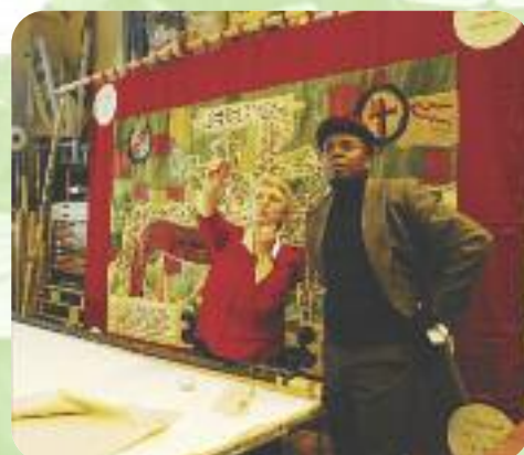
Stitches in Time inspire local leaders during an LSx Community Tour