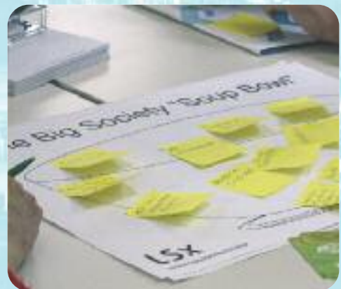
Delegates use LSx's innovative techniques to get thinking about the Big Society