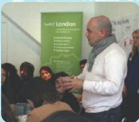
Delegates engage in discussions at our Big Society Conference

delegate at The Big Society: Making a return on community investment, February 2011